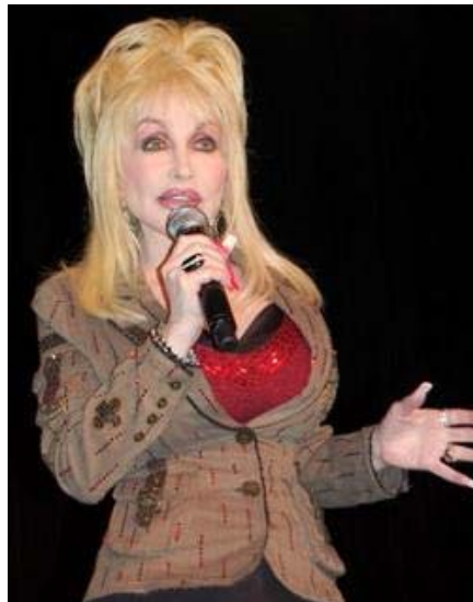
Dolly Parton performs in Nashville